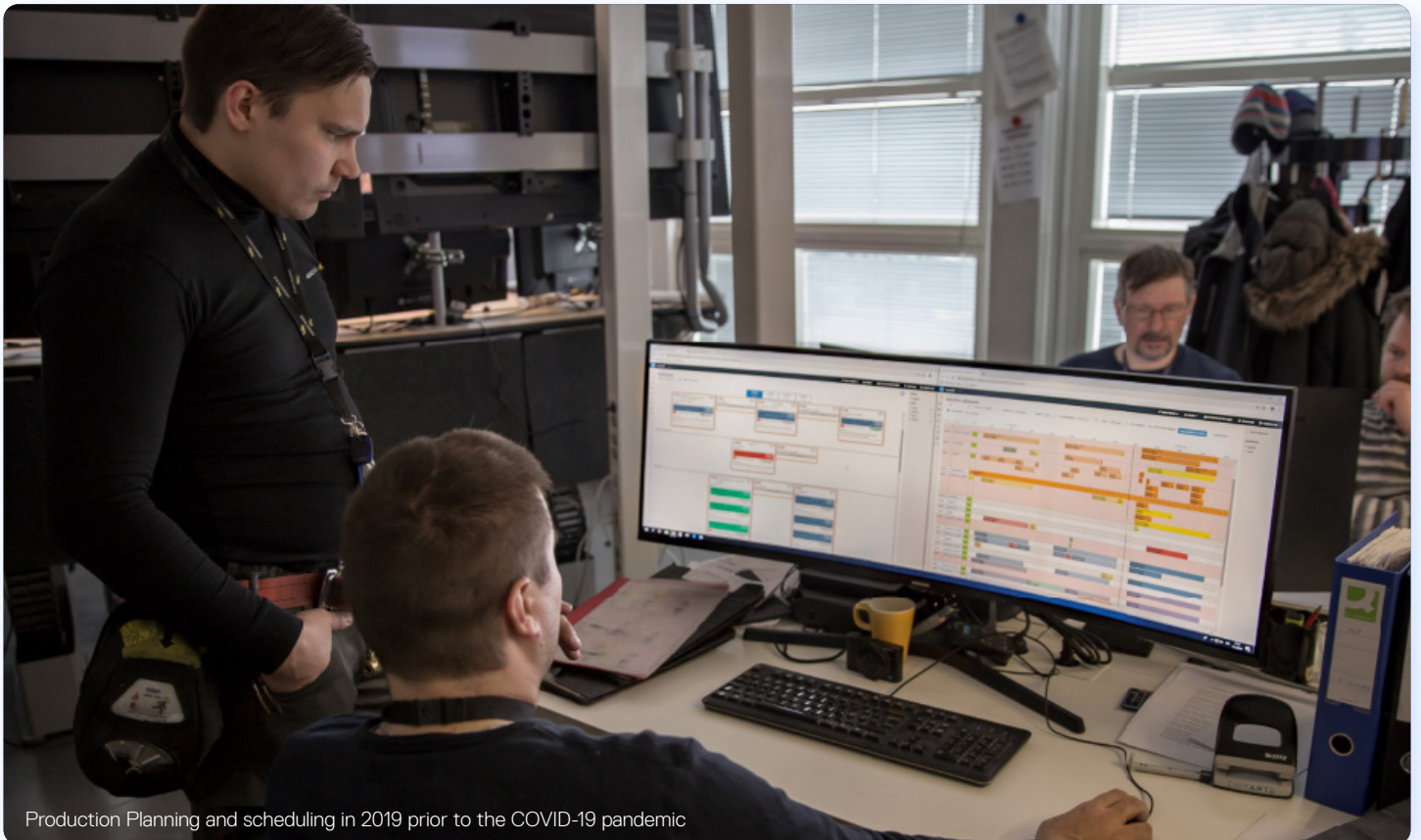
Production Planning and scheduling in 2019 prior to the COVID-19 pandemic

Operators report work starts and stops, achievements and delays continuously throughout the shift. This allows live and continuous planning by control room personnel. As soon as the last piece of information from the current shift is captured, the next shift plan is ready, leaving shift supervisors more time for actual supervising, and ensuring safety and work quality. A live planning approach, including a better overview of all work plans, and a platform for central communication, ensures that everyone has the same up-to-date information. There is no need to go hunting for information because everything is available in the Deswik.OPS live web environment or in the reporting database.