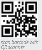
scan barcode with QR scanner