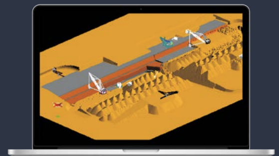
Integration with 3d-DigPlus from Earth Technology